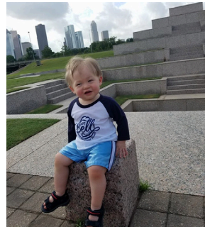
#TEAMBELLS SELLS TINIEST MEMBERS The Future of Greater Inwood