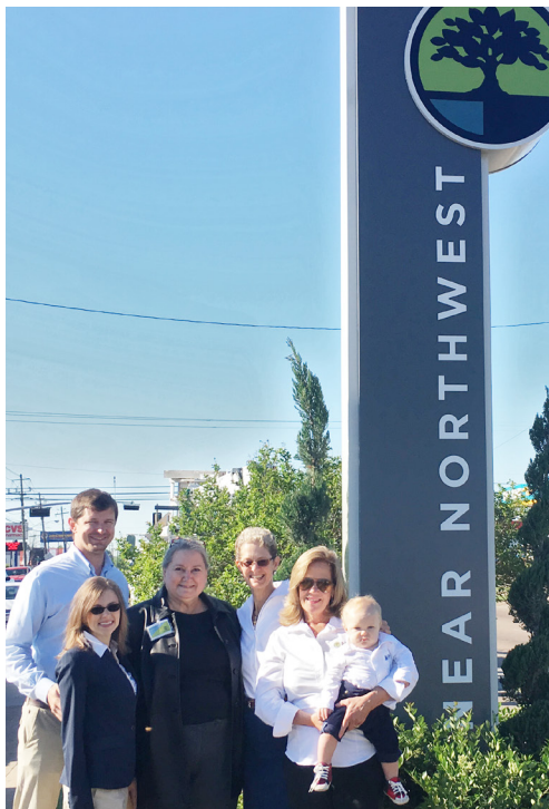
NNMD BOARD & STAFF WITH #TEAMBELLS SELLS Monument Marker Unveiling